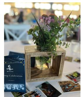
Centerpieces for the event were created by Build Trybe youth.