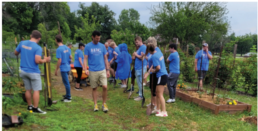
Volunteers from MarksNelson working at our farm site on the Ozanam Campus building a path.