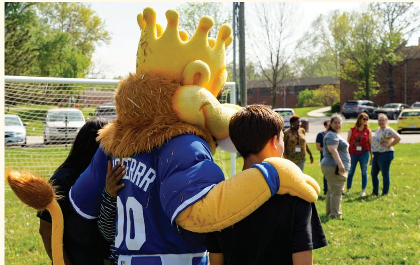
Sluggerrr meets some of the Ozanam Campus youth.

Cornerstones of Care supporters can continue to help our youth through Royals Charities. Each ticket purchased for a Royals' game through royals.com/communitypartners using the code Cornerstones2022! will donate $3 to Cornerstones of Care. *