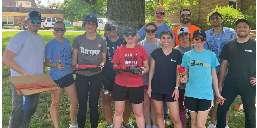
Volunteers from Turner Construction painting curbs red in front of the Administration building on the Gillis campus.